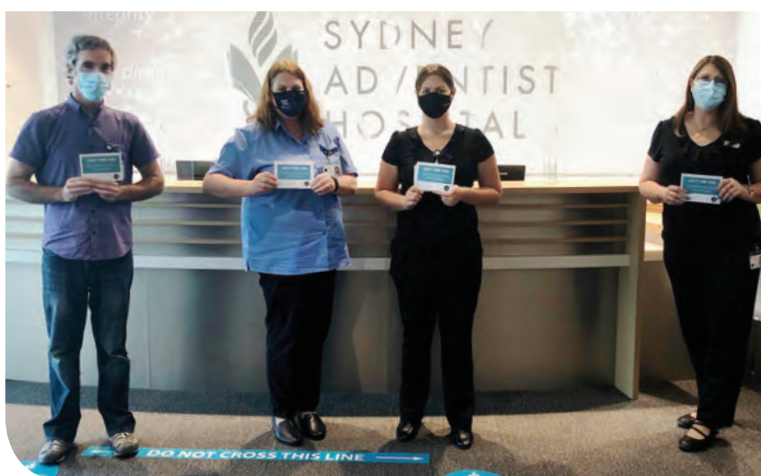
Staff from Reception and Temperature Checking Stations with their Pay It Forward vouchers

A little of bit of cheer began spreading throughout the hospital in December with the launch of San Foundation's Pay it Forward project with San Café. Customers at the Café can purchase a voucher to pay forward a hot drink as a small gesture of thanks or thoughtfulness. They can choose to deliver the voucher