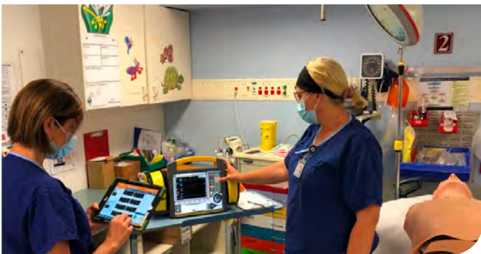
Emergency staff testing their skills