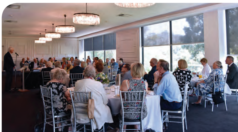
Smaller gatherings in 2020 became the norm