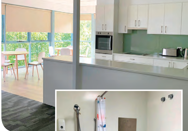
Updated kitchen, meals and bathroom areas