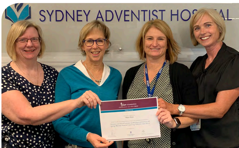
SAH Community Palliative Care team receiving their award